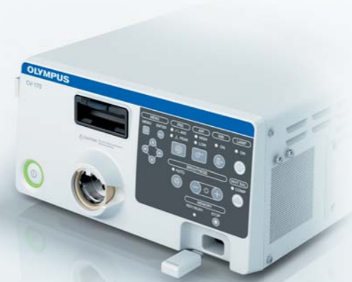
Portable memory Portable memory (MAJ-1925) is compatible, which is the standard for data management. Simply connect and upload.