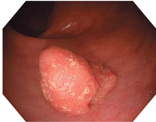
Normal focus mode

Dual focus, a unique OLYMPUS optical innovation allows the user to select from two focus settings. With the simple push of a scope button, the desired depth of field for observation can be optimized to either the near field or normal field and it delivers superior imaging at the same time.